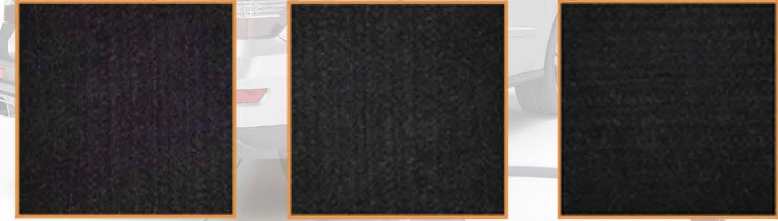
F-55 Black 55B0078 (1.980mm/.078") F-55 Black 55B0093 (2.360mm/.093") F-55 Black 55B0125 (3.180mm/.125")

SAE U.S. Federal Specifications C-F-206G