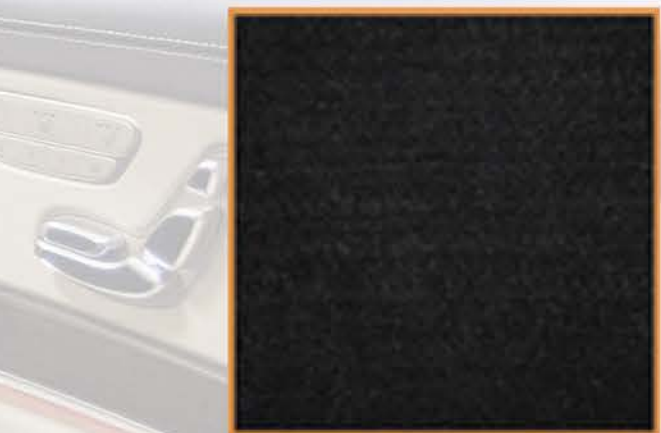
F-55 Black 55B0227 (5.770mm/.227")