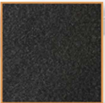
Sunburst 1000 Black 123125B-54 (3.180mm/.125") Sunburst 1000™ also available in white