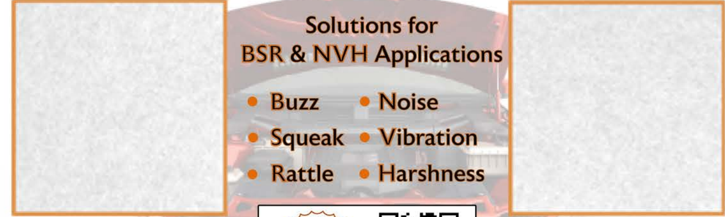
Sunburst 1000 White S150160 (1.070mm/.042") Sunburst 1000 White S150160-020 (.640 mm/.025")