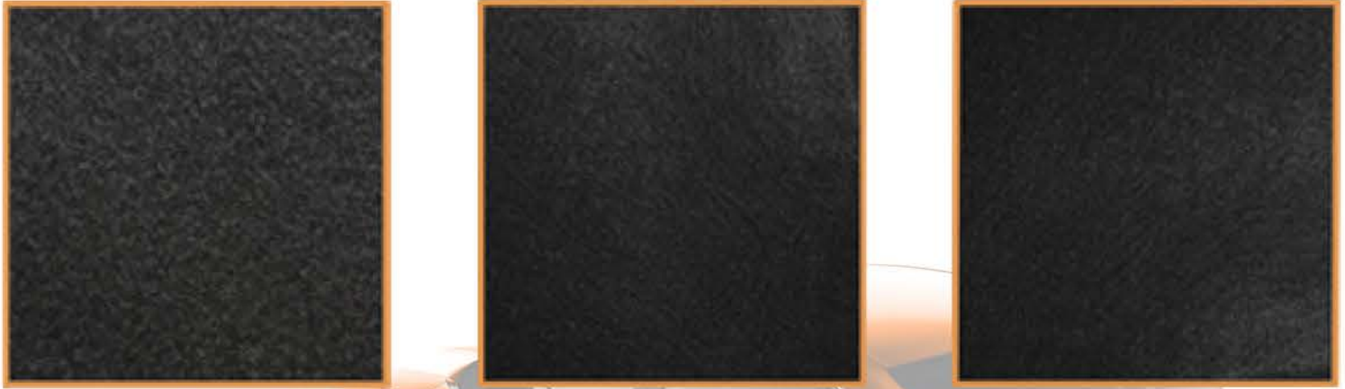
Sunburst 1000 Black S150360 (1.070 mm/.042") Sunburst 1000 Black S150360-020 (.640mm/.025") Sunburst 1000 Black S150360-031 (.790mm/.031")