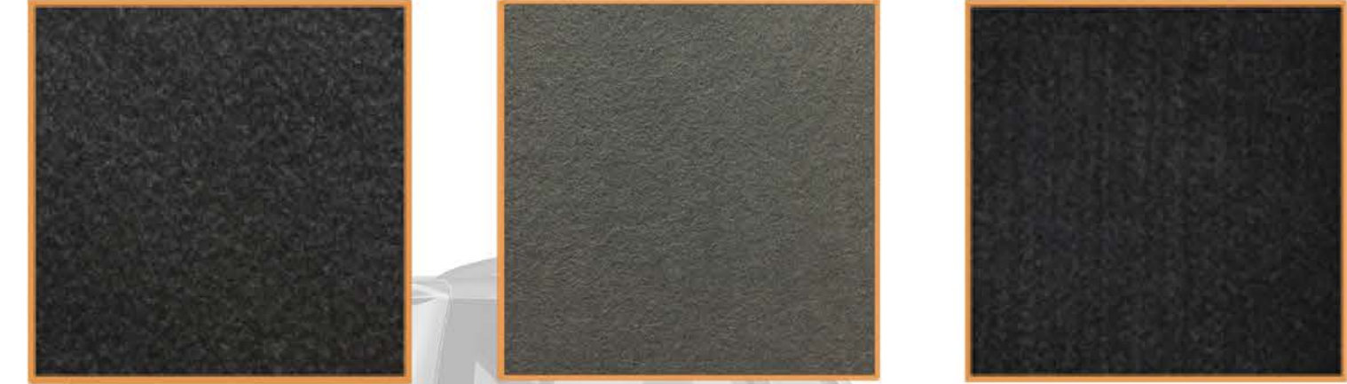
Prism 7000 Black P750372 (1.270mm/.050") Prism 7000 Grey P757472 (1.270mm/.050") F-55 Black 55B0062 (1.570mm/.062")