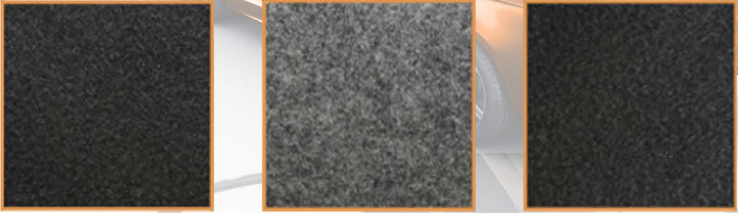
Sunburst 1000 Black S150360-062 (1.570mm/.062") Sunburst 1000 Smoke S157660 (1.270mm/.050") Sunburst 1000 Black 115078B-54/72 (1.980mm/.078")