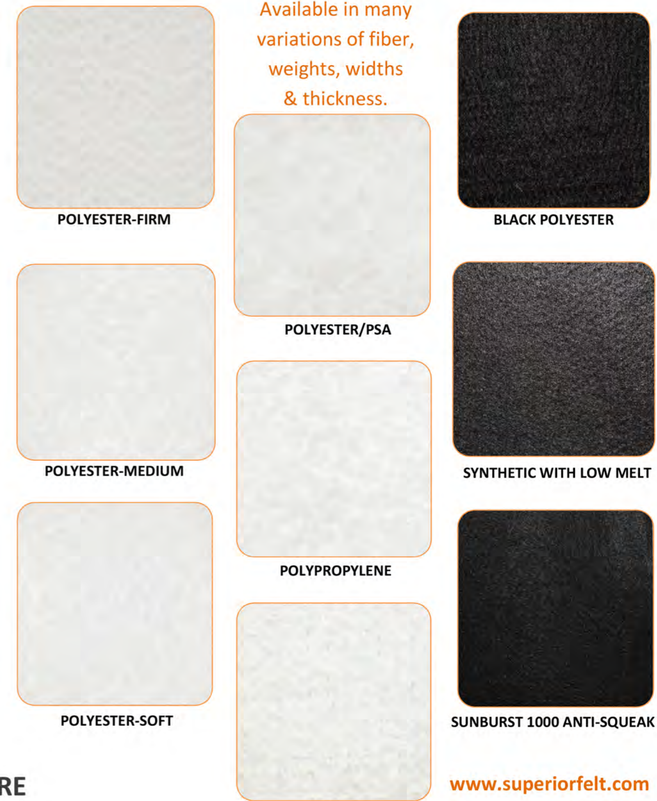
POLYESTER-FIRM BLACK POLYESTER

Available in many variations of fiber, weights, widths & thickness.