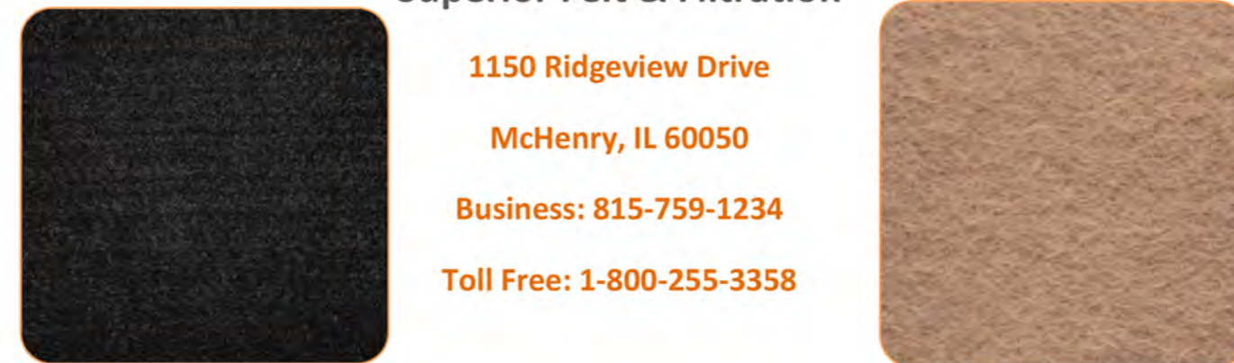
F-55B 325F ORTHOPEDIC

1150 Ridgeview Drive McHenry, IL 60050 Business: 815-759-1234 Toll Free: 1-800-255-3358