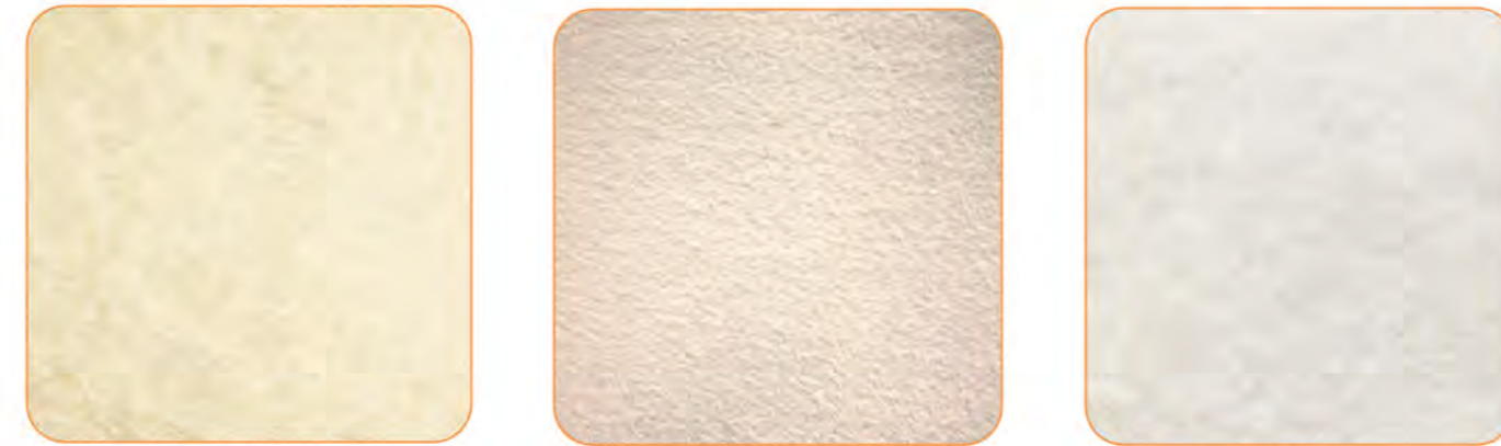
F-50 WOOL SHEET FELT 325 ORTHOPEDIC

*Shades of industrial wool felt can change slightly due to the variability of natural and reprocessed fiber.